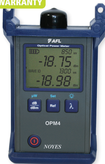
OPM4 Optical Power Meter