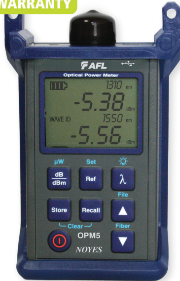
OPM5 Optical Power Meter